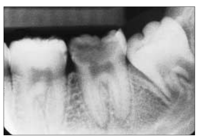
Figure 2: Periapical radiograph of the left posterior mandible demonstrating extensive decay associated with tooth 37. Note the stage of root development of tooth 38.