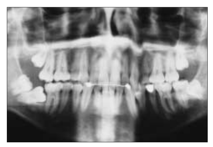
Figure 1: Panoramic radiograph revealing horizontally impacted teeth 47 and 48. Note the stage of root formation of tooth 48.