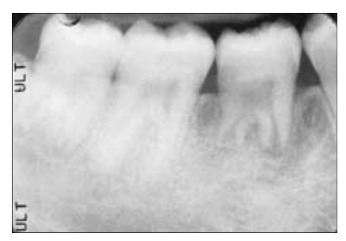
Figure 5: Six-month post-operative radiograph indicates patient has regained the supporting alveolar bone in the region of the tooth transplant and shows continued root development with the establishment of a periodontal ligament space.

should be followed for a couple of days after surgery and the patient should be instructed to avoid mastication on the transplant. Patients should be instructed to maintain optimal oral hygiene. Some investigators feel that the patient should rinse with chlorhexidine gluconate mouth rinse as an adjunct to oral hygiene. Patients may also be given perioperative and post-operative antibiotics. 1,4,6,14,17