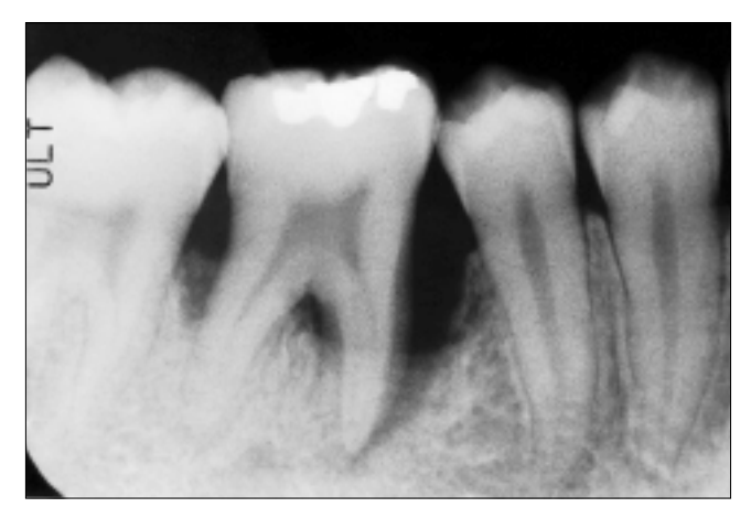
Figure 3: Periapical radiograph showing localized juvenile periodontitis associated with tooth 46.