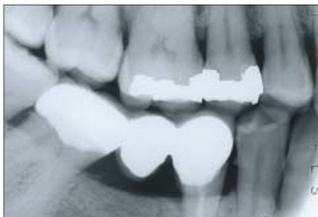
Figure 12: Radiographic image of the fixed partial denture just over 7 years after initial recementation with a dentin-bonded resin cement. The recementation helped to maintain the integrity of the dental arch over the years and preserved the abutment teeth from caries.