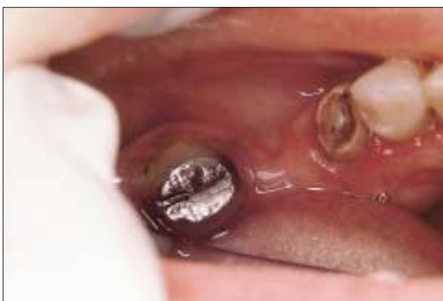
Figure 11: A posterior porcelain-fused-to metal fixed partial denture dislodged in this case due to recurrent caries in the mesial abutment.