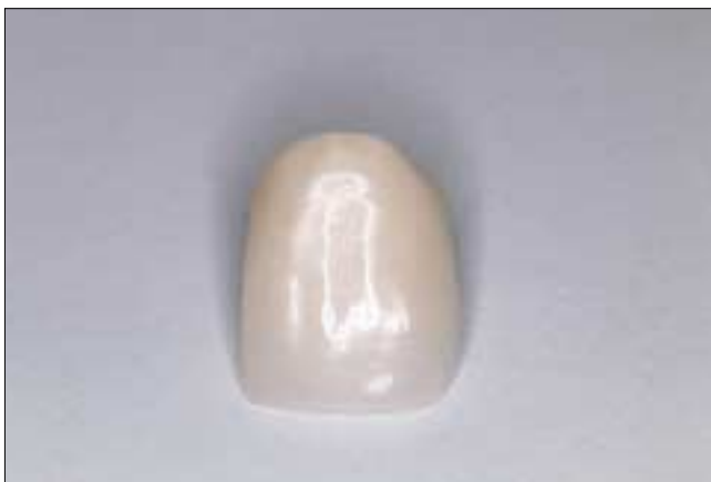
Figure 7: This all-porcelain crown belonged to the tooth in Fig. 6. Note the excellent condition of the crown.