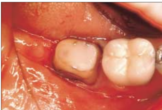
Figure 9: The mandibular second molar shown in Fig. 8 after restoration with a resin composite material and extending the original crown preparation subgingivally.