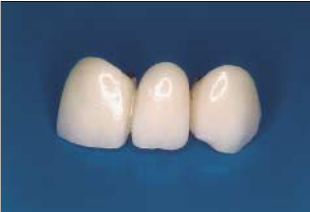
Figure 1: Dislodged anterior porcelain-fused-to-metal fixed partial denture one year after initial insertion. The prosthesis is in excellent condition, but the supporting structure had design errors.