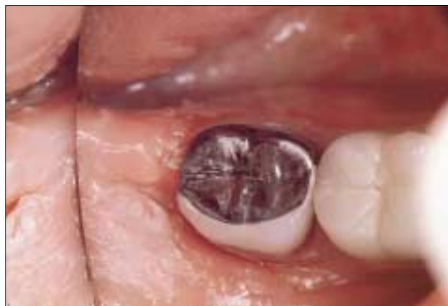
Figure 10: The fabricated porcelain-fused-to-metal crown was cemented with a resin cement following a bonding procedure to enhance retention. The occlusal surface of the crown had to be made in metal to minimize occlusal reduction and thus maximize crown height.