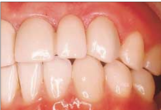
Figure 5: Post-operative view after cementation of the original prosthesis with a resin cement. Note the excellent colour match.