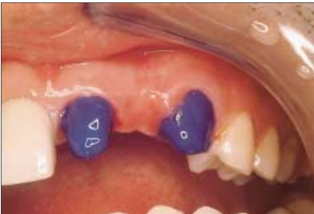
Figure 3: Following cleaning, the surfaces of the abutment teeth were etched with a phosphoric acid etchant gel for 20 seconds.