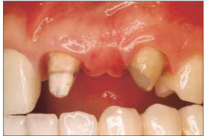
Figure 2: The abutment teeth supporting the fixed partial denture shown in Fig. 1. Note the conical shape of the canine abutment and the excessive angle of convergence of the incisor abutment.