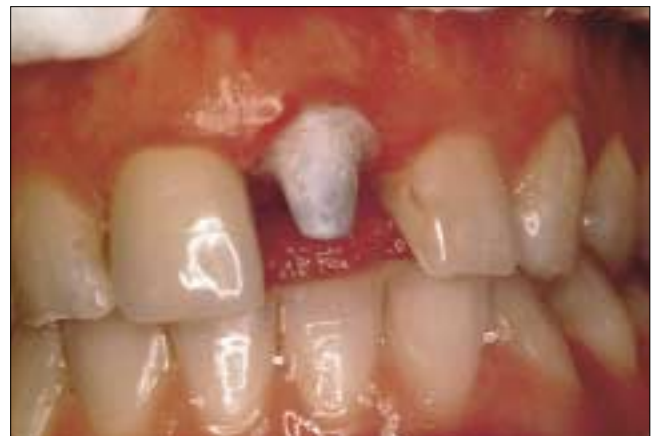
Figure 6: This maxillary central incisor had an all-porcelain crown that dislodged just one year after initial insertion. The tooth was prepared with an excessive angle of convergence.