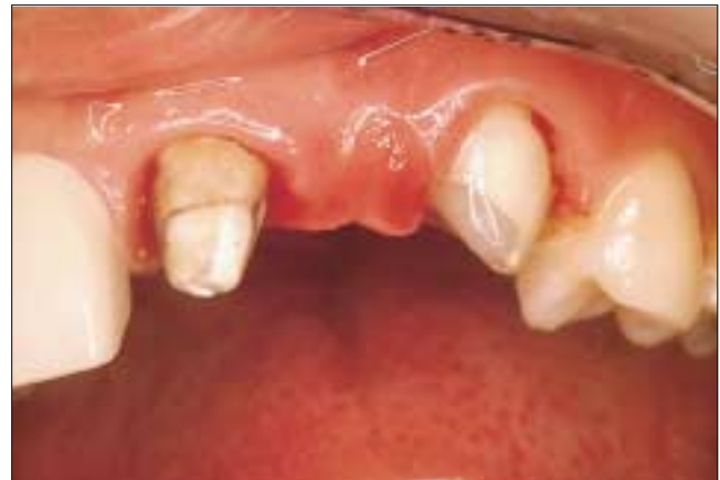
Figure 4: Following etching of the abutment teeth, the surfaces were primed with a dentin bonding agent. Note the shiny appearance of the dentin surfaces after this step. The shine is a good indication of thorough priming.