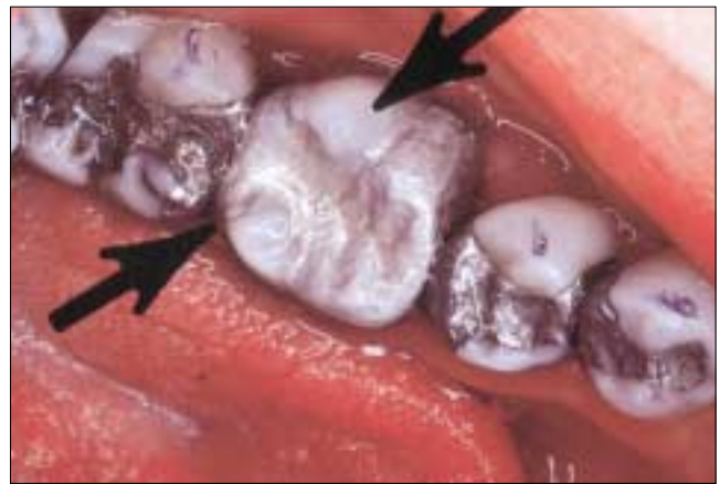
Figure 3: An extensively restored mandibular left first molar. The tooth has been weakened by the placement of an extensive intracoronal restoration. The arrows indicate the areas most prone to future crack formation.

principle of the so-called “bite tests” where the patient is instructed to bite on various items such as a toothpick, cotton roll, burlew wheel, wooden stick, 2,13,14 or the commercially available Tooth Slooth (Professional Results, Inc., Laguna Niguel, Calif.) (Fig. 1a). 2 Pain increases as the occlusal force increases, and relief occurs once the pressure is withdrawn (though some patients may complain of symptoms after the force on the tooth has been released). 2,3,11 The results of these “bite tests” are conclusive in forming a diagnosis (Fig. 1b).