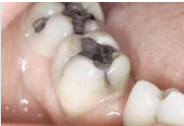
Figure 2: Stained crack lines on the mesial and buccal surfaces of a mandibular molar. If this tooth is asymptomatic, no treatment is required and the tooth should be monitored closely.