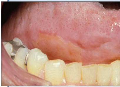
Figure 1: Patient with hyposalivation, dry mucosa and chronic ulceration on lateral border of the tongue.