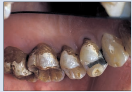
Figure 3: Extensive demineralization and cavitation of teeth in a patient with hyposalivation.

scintigraphy can be used to assess salivary gland function. Biopsy of minor salivary glands may be useful in diagnosis of SS and is required for diagnosis of salivary gland neoplasms. Fine-needle aspiration biopsy may be useful to identify lesions suspected of malignancy. 23