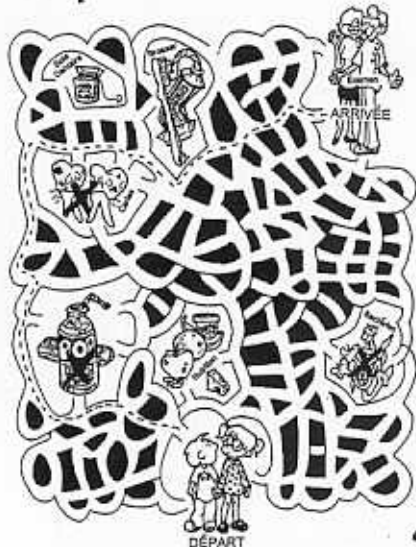
Retrouvez votre chemin au cabinet du dentiste.