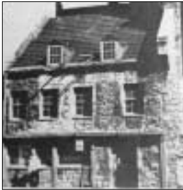
First Dental School in Quebec, Phillips Square, Montreal, 1892