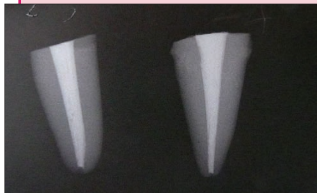
Figure 1: Example of radiograph used to evaluate the quality of the root filling, specifically, homogeneity and apical extension.

The root canal of each specimen was irrigated with 1% sodium chloride (NaOCl) and explored with a size 10 K-file (Dentsply/Maillefer, Ballaigues, Switzerland). For each specimen, the file was introduced into the canal and advanced until its tip could be seen through the apical foramen. The working length was defined as 1 mm less than the length of the root. The teeth were prepared with a hand instrumentation technique using size 15 to 50 K-files. The last instrument for each tooth was the size 50 K-file, to standardize the enlargement of the canals. The root canals were irrigated with 2 mL of 1% NaOCl at each change of file size, followed by aspiration and drying with absorbent paper points (Tanari, Manaus, Brazil).