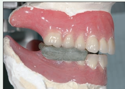
Figure 2: The mandibular denture is remounted against the maxillary denture using the interocclusal record obtained in centric relation. The dentures are ready for occlusal adjustment.