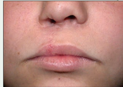
Figure 6: After functional lip revision, Le Fort I osteotomy and bone graft.

a computed tomography scan, if indicated, to get a better appreciation of the anatomy of the cleft maxilla. The nose is assessed for asymmetry and flattening of the ala on the cleft side. The facial skeleton is assessed for dentoskeletal abnormalities by clinical evaluation and lateral cephalometric radiograph (Fig. 4) and analysis. Maxillary anteroposterior deficiency and consequent lack of lip support are common in patients with a cleft lip.