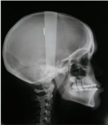
Figure 4: Maxillary deficiency.