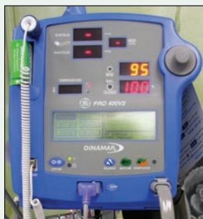
Figure 1: An example of suitable monitoring equipment to assess pulse, oxygen saturation and blood pressure during conscious sedation.

The scope and nature of treatment required, the experience and training of the provider and the preference of the parent will dictate overall behaviour guidance strategy, including sedation modality and agent. For the pediatric population, some commonly used sedating agents include dimenhydrinate, hydroxyzine, midazolam, chloral hydrate and nitrous oxide/oxygen. Thorough medical assessment should include a review of past and current medical status and medication use. For some children, consultation with their physician may be necessary. Visual appraisal of tonsillar volume to assess airway patency and a review of baseline vital signs should be carried out. Proper documentation of parental informed consent should include detailed preoperative preparations (including fasting requirements),