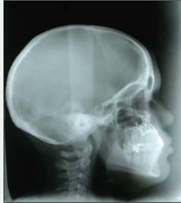
Figure 5: After Le Fort I osteotomy.