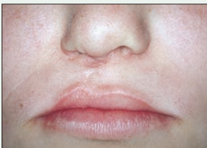
Figure 1: Lips at rest before surgery.

Functional assessment of the lip is important to achieving optimal esthetics. The lip is assessed at rest ( Fig. 1 ) and in projection ( Fig. 2 ) to determine whether the muscular repair done in the previous surgery was adequate and accurate. The lip in repose is assessed for symmetry, scar and vermilion deformities. The lip in projection is assessed for symmetry and muscle bulge. Radiographic examination is done initially with periapical, occlusal ( Fig. 3 ) and panoramic radiographs, followed by