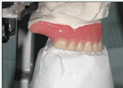
Figure 1: The maxillary denture is remounted using the remount index sent by the laboratory.

A dietary analysis should be carried out to assess if the patient might have a diet low in protein or vitamin B12. Treatment consists of dietary coun-