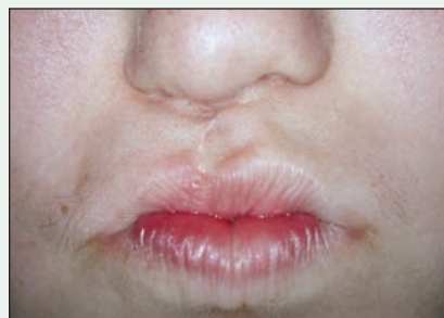
Figure 2: Lips in projection before surgery.