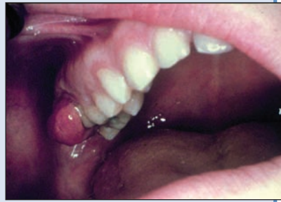
Figure 3: Pyogenic granuloma.

such imaging, the dental staff will practise the ALARA (As Low As Reasonably Achievable) principle and that only radiographs necessary for diagnosis will be obtained. 8