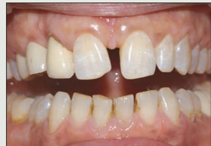
Figure 2: The retainer on the maxillary right lateral incisor is out of ideal positioning, and the colour of the tooth does not match that of adjacent teeth. In the open position, the fracture on the incisal edge of the maxillary central incisor is more obvious. Staining of the lower incisors adds to the esthetic problem.