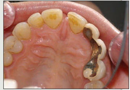
Figure 5: Lingual view of the maxillary anterior area. The lingual aspect of the 3-unit FPD shows the unsightly appearance of the metallic framework. Prior endodontic treatment of the maxillary lateral incisor had been performed through the FPD retainer, and the access opening had been sealed with resin composite. In addition, part of the veneering porcelain on the distal aspect of the retainer on the first premolar had fractured.