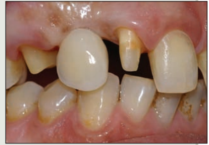
Figure 14: The implant-supported crown was the first to be inserted.