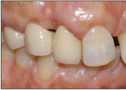
Figure 3: Close-up view of the maxillary right side. The canine, which is the pontic part of a 3-unit FPD, appears significantly shorter than the lateral incisor and has a flattened incisal edge.