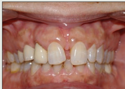
Figure 1: Intraoral view of a 51-year-old woman shows excessive diastema between the maxillary central incisors. The maxillary right central incisor has an incisal fracture at the mesial side and appears mesially tilted. The maxillary right lateral incisor is acting as an abutment for a fixed partial denture (FPD).

Lingual examination revealed the unsightly appearance of the metallic framework of the 3-unit porcelain-fused-to-metal FPD (Fig. 5). Prior endodontic treatment of the maxillary lateral incisor had been performed through the FPD retainer and the access opening had been sealed with resin composite. Part of the veneering porcelain on the distal aspect of the premolar retainer had fractured, and the remaining anterior teeth had dark extrinsic staining.