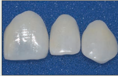
Figure 13: Porcelain veneers for the maxillary left central and lateral incisors and the left maxillary canine.