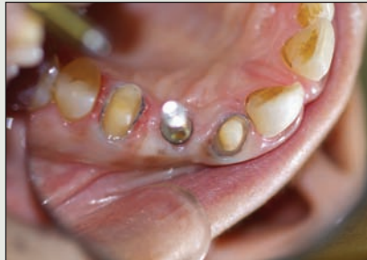
Figure 10: At the impression-taking stage, the implant healing cap was removed and the transfer coping secured in place. A retraction cord was placed in the sulci of the other prepared teeth.