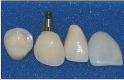
Figure 12: Two ceramic crowns and an implant-supported crown and porcelain veneer for the right maxillary central and lateral incisors, canine and first premolar. The difference in colour between the veneer and the crowns relates to the minimal thickness of the veneer.