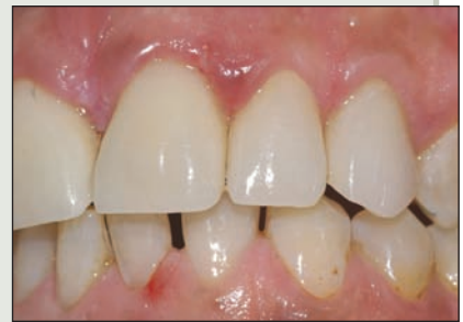
Figure 17: An appropriate shade of resin cement was selected and used to secure the 4 porcelain veneers.

and the first premolar (Procera Crown Zirconia, Nobel Biocare) (Fig. 12). An implant abutment made of zirconium oxide and matching the size of the inserted implant was veneered with matching porcelain (Procera Abutments, Nobel Biocare). For the remaining 4 prepared teeth, porcelain veneers were fabricated using matching feldspathic porcelain (Fig. 13).