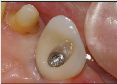
Figure 15: The implant screw was torqued with a manual torque wrench before the opening was closed with a composite resin.