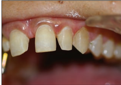
Figure 9: Four maxillary anterior teeth were prepared to receive porcelain veneers.