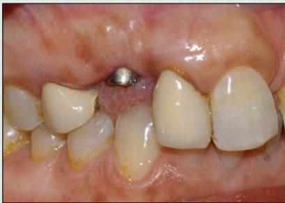
Figure 6: The pontic of the FPD was severed, and an implant was inserted into the space. This view shows the healing cap.