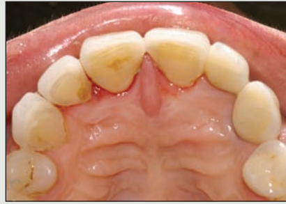
Figure 19: Lingual view of the maxillary anterior region. The appearance of the right side has been improved dramatically by using 3 crowns to replace the porcelain-fused-to-metal FPD.

postoperative view ( Fig. 19 ) shows a dramatic improvement in the appearance of the teeth on the right side after replacement of the conventional porcelain-fused-to-metal FPD with 3 crowns.