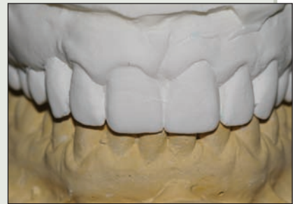
Figure 8: A diagnostic wax-up was made and duplicated in stone. The duplicate stone model was used for fabrication of a clear matrix with a vacuum moulding machine.

The patient reported dissatisfaction with the FPD, both in terms of its appearance and because she was unable to properly floss between the teeth. Although the diastema between the 2 maxillary central incisors had been present for many years, she had noticed that her teeth were drifting, the diastema was increasing in size and the colour of the teeth was becoming darker.