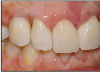
Figure 16: The ceramic crowns of the maxillary lateral incisor and first premolar were cemented with a resin cement. Restoration of the anatomic features of the teeth, as shown here, is key to achieving a natural, pleasing smile.