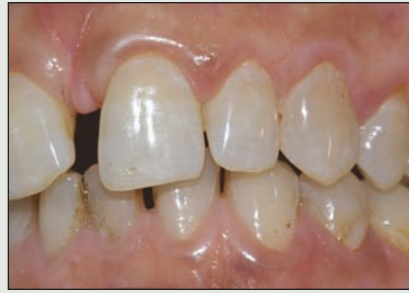
Figure 4: Close-up view of the maxillary left anterior side. The teeth are discoloured, and the incisal edge of the central incisor is worn down at a slant.