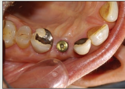
Figure 7: The retainers of the FPD were left in place on the maxillary lateral incisor and the first premolar throughout the healing period for the inserted implant.