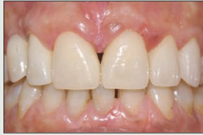
Figure 18: Immediate postoperative view. The colour of the veneers blends nicely with that of the crowns. This match was achieved by selecting the most appropriate shade of resin cement.