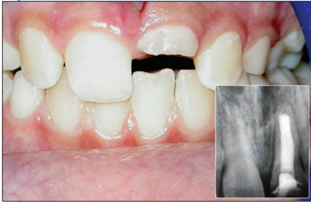
Figure 3: Intraoral view of the incisor 6 months after the trauma. Note the extent of re-eruption. Inset: Radiographic view of the obturated root revealing apical closure and no resorption of the root.