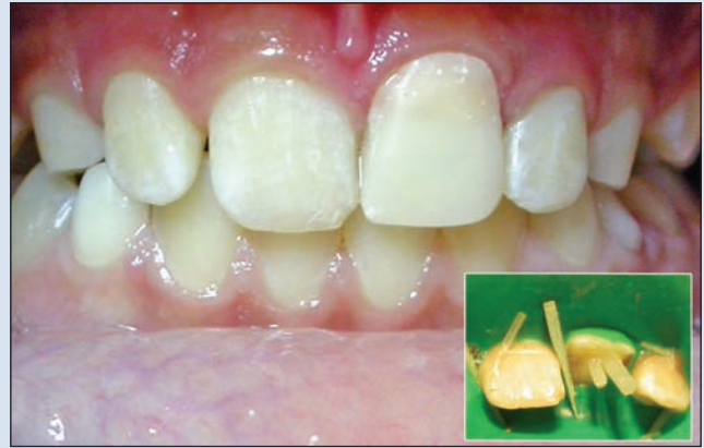
Figure 4: Final esthetic result of the coronal restoration after the application of a glass-fibre-reinforced composite root canal post (inset).

traumatized incisor was thought to be the result of re-eruption of the tooth in the labial direction, which first occurred after gingival healing, and thereafter after palatal gingivectomy ( Fig. 2 ). Presumably, the trauma slightly dislodged the root in the labial direction, and over time, the attached gingival line followed the labial re-eruption pattern of the crown, ending up higher than the right central incisor. Since the extent of orthodontic force required to correct the root inclination could initiate root resorption, the treatment plan comprised root canal treatment and a coronal restoration, followed by orthodontic treatment at a later stage.