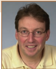
Dr. Paul Santerre: What dentists should remember and apply from their DDS training in biomaterials

Composite materials are multi-component formulations that have evolved over decades of research, development and testing to improve quality and overcome such issues as low degrees of polymerization, the impact of degradation products on tissues, premature breakdown in clinical wear settings, and poor mechanical and handling properties. The high quality of a material and the documentation associated with it are reflected in its price.