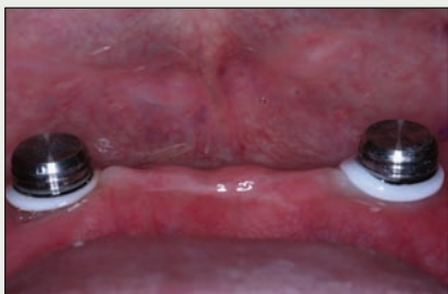
Figure 4: White spacer rings and housings positioned over the locator abutments.