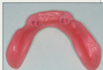
Figure 7b: Final view of the overdenture.

retention forces) and a locator core tool, which consists of 3 parts ( Fig. 1 ): a curved insert removal component for catching and pulling the nylon insert out of the permanent metal housing (upper part of tool); an insert seating component for seating a replacement insert into the metal housing (middle part of tool); and the locator abutment driver, for positioning and tightening the abutment (lower part of tool).