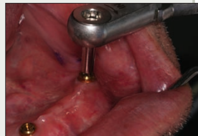
Figure 3b: Torque wrench for final tightening.