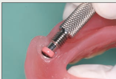
Figure 7a: A pink replacement insert is seated into the metal housing.