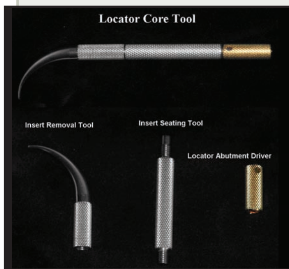
Figure 1: Locator core tool, which has 3 parts.

This article presents the chairside processing technique (direct method) for a low-profile attachment system (Astra Tech locator housing and male attachments) as an alternative to ball attachments. This locator system contains locator abutments suitable for all Astra Tech fixture diameters, a locator process kit, a spacer, a processing cap and 4 retention inserts in different colours (representing different