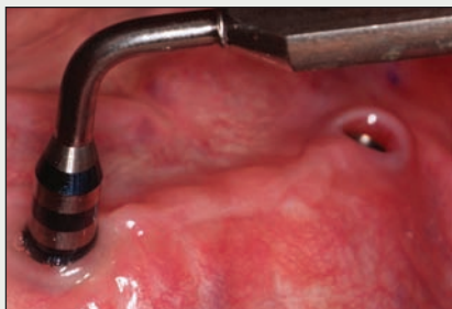
Figure 2: Depth gauge for measuring the gingival height.