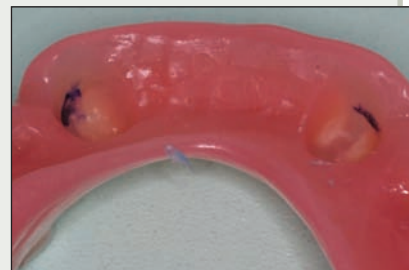
Figure 5b: Scraped parts are painted with an indelible pencil.