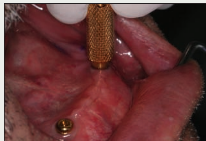
Figure 3a: Locator abutment driver for positioning and hand-tightening the locator abutment.