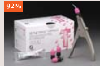
GC Fuji TRIAGE (GC America)