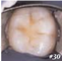
Minimally invasive preparations