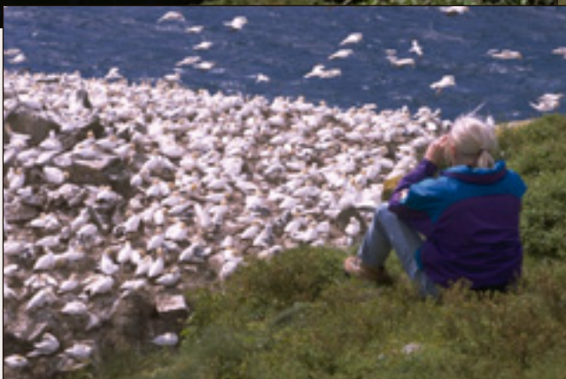
A "bird's eye view" at Cape St. Mary's Ecological Reserve.