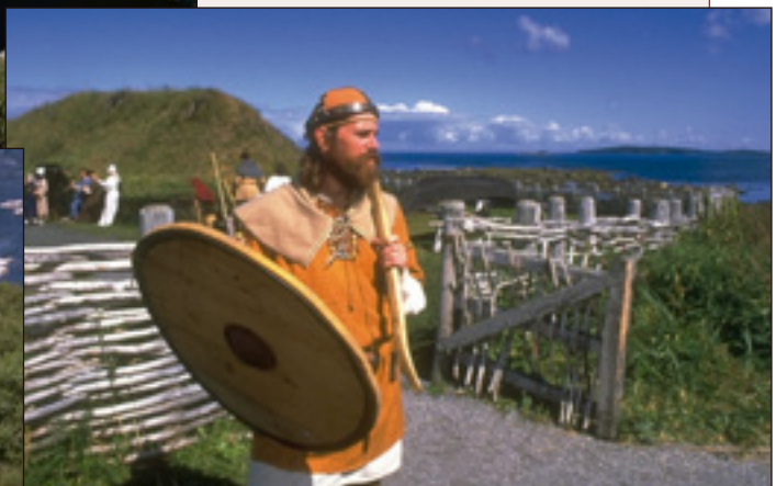
The archaeological site at L'Anse aux Meadows on the Great Northern Peninsula.