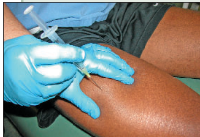
Figure 3: Administration of epinephrine into the thigh.