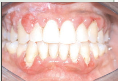
Figure 1: Photograph of a patient with diabetes and periodontitis. Although there are obvious local factors, this patient's condition is undoubtedly related to worsening of glycemic control, and hence, elevated levels of glycated hemoglobin.

In this situation, you should ask the patient to see his or her physician to determine whether glucose is in fact being controlled effectively. One of the most reliable tests of glucose control involves determining the level of glycated hemoglobin (hemoglobin A1c). Glycated hemoglobin (Fig. 2) is a protein formed by reaction of amino acid side chains with glucose molecules, particularly during periods when serum glucose is high. Glycated hemoglobin has a long half-life in serum. For a patient with "borderline" diabetes, a random blood sugar measurement might be normal. However, if the patient has relatively short peaks of high blood sugar, more hemoglobin A1c will be formed and will stay in the blood for several weeks. Hence, measurement of hemoglobin A1c gives a more accurate assessment of the patient's sugar control than random measurement of blood glucose levels. You or the patient can request this test when talking to the patient's physician.