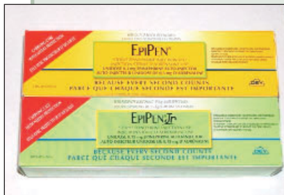
Figure 1: EpiPen auto-injector.

IM injections of epinephrine can be given in a number of ways. The EpiPen system (Dey, Napa Valley, Calif.; Fig. 1) and the new Twinject system (Verus Pharmaceuticals, Inc., San Diego, Calif.; Fig. 2) are preloaded auto-injectors. Both of these systems contain 0.3 mg of epinephrine for adults. The EpiPen Jr. and pediatric Twinject auto-injectors (for people less than 30 kg [66 lb]) contain 0.15 mg of epinephrine. The least expensive, yet most versatile, method of administering epinephrine is with a manual needle and syringe with glass ampoules of epinephrine at a concentration of 1:1000. There are 2 important points to remember about all 3 of these systems. First, none of the systems is mistake-proof when it comes to