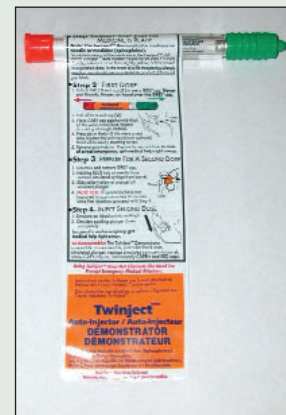
Figure 2: Twinject auto-injector.