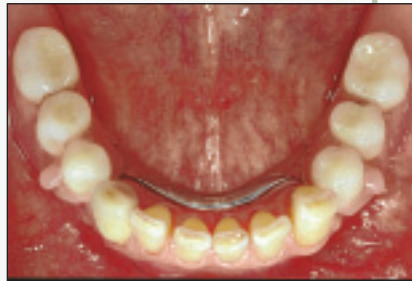
Figure 1b: The removable partial denture is retained by the implants in the first premolar region.