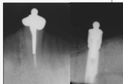
Figure 2c: Radiograph showing the root cap (tooth 43) and the implant (region 33).