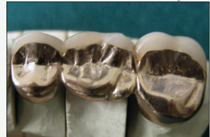
Figure 6: Repaired restoration ready for cementation.

and attention must be exercised to avoid overheating a porcelain-fused-to-metal restoration during laser-welding (the porcelain might pop off if overheated). The restoration is welded both internally and externally. The weld on the internal aspect of the restoration is then adjusted to fit the original die, if available. The occlusal aspect is also refined as necessary.