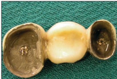
Figure 5: Internal view of laser-welded repair.