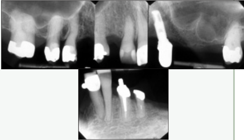
Figure 3c: Periapical radiographs showing the residual dentition in the upper and lower jaws, with adhesive attachments (teeth 11 and 42), implant (region 23) and a root cap (tooth 34).

caries-free or sufficiently restored ( Fig. 1a ), clasps are generally indicated but are frequently not acceptable to the patient because of esthetic concerns. With implants placed distal to the posterior teeth on each side, sufficient retention can be achieved and the need for clasps eliminated; the residual dentition then becomes detached from the restoration ( Figs. 1b and 1c ).