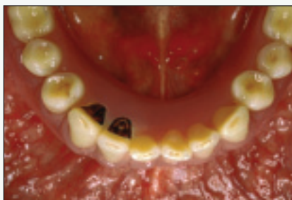
Figure 2b: Overdenture prosthesis with a backing in the area of the root cap (teeth 42 and 43).