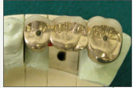
Figure 3: Prosthesis on model ready for repair.