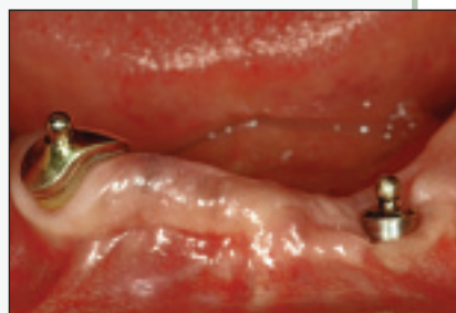
Figure 2a: Tooth 33 has been replaced by an implant that incorporates a ball abutment.