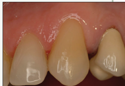
Figure 4c: Improvement of the marginal tissue response and restorative camouflaging 2 weeks after the procedure.