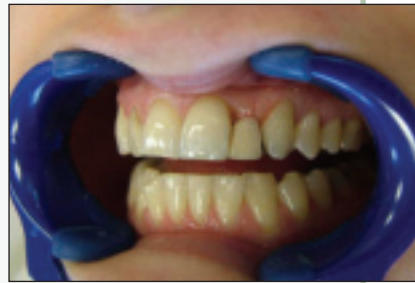
Figure 2: This photograph of the patient shows a lack of harmony in the soft tissue.