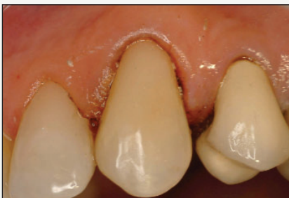
Figure 4b: Completed restoration after removal of the retraction cord and finishing of the proximal margins.