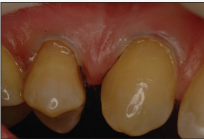
Figure 3: Glossy appearance of the preparation before the application of bond resin.