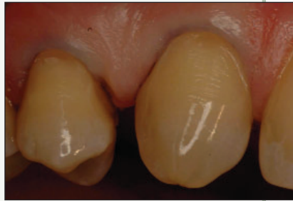
Figure 2: Preparation of the lesion with gingival retraction, chamfer gingival margin and long coronal level.