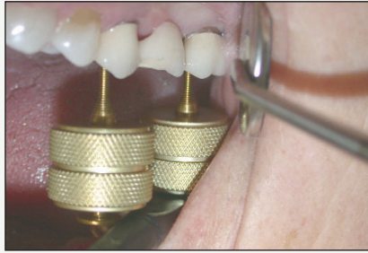
Figure 2: Two self-taping instruments threaded into abutments.