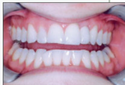
Figure 5: Photograph of the completed implant showing the development of soft tissue and papilla, which was aided by immediate provisionalization and soft-tissue manipulation.