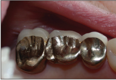
Figure 1: A functional 26-year-old fixed prosthesis in which the porcelain was fractured and no longer matched the remaining natural teeth.