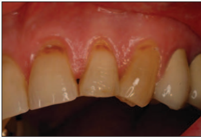
Figure 1: Abfraction lesions and the development of root caries.