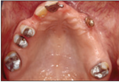
Figure 3a: An implant with telescope crown in region 23 provides additional retention.