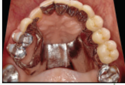
Figure 3b: Removable partial denture is retained by an adhesive attachment (tooth 11), an implant and posterior clasps.