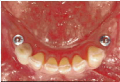
Figure 1a: Kennedy Class I situation, with bilateral free end.

In cases with residual anterior dentition (bilateral free end), either