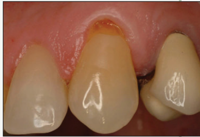
Figure 4a: Appearance of an abfraction lesion before preparation for restoration. Root caries and rolled gingival contour are evident.