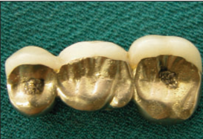
Figure 4: Occlusal view of laser-welded repair.