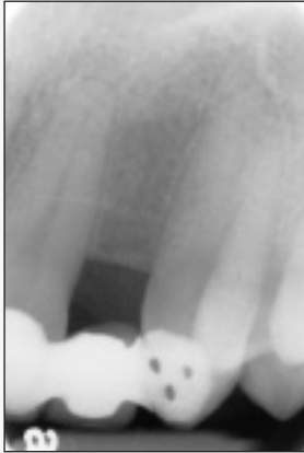
Figure 1: A patient requested improvement of a problematic Maryland bridge. Radiography showed a lack of development of inter-radicular bone and a flat bony contour.

Metabolic diseases or other conditions could compromise healing. Therefore, systemic health concerns such as diabetes or a recent history of radiation therapy would contraindicate immediate loading. Current smokers and patients with poor oral hygiene are not candidates for this treatment strategy.