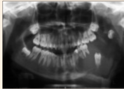
Figure 2: Plain radiograph showing an expansile lesion with impacted teeth.

similar to the solid ameloblastoma. It is uncommon, usually presenting as a painless, non-ulcerated sessile or pedunculated gingival lesion on the alveolar ridge. 4 Several histopathologic types of ameloblastoma are described in the literature, including those with plexiform, follicular, unicystic, basal cell, granular cell, clear cell, acanthomatous and desmoplastic patterns. 2