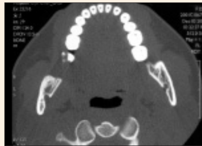
Figure 3d: Three years after treatment.