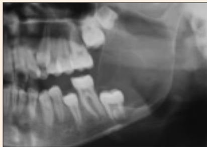
Figure 1a: Large, expansile lesion in the left mandible.