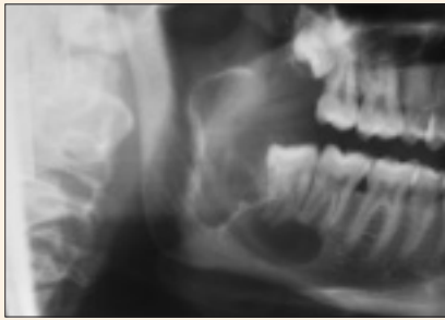
Figure 3a: Plain radiograph showing a loculated lesion in the right mandible.