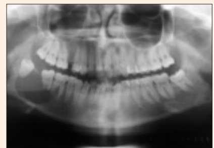
Figure 4: Plain radiograph showing a radiolucent lesion that caused resorption in the root of the adjacent tooth.

reveal unilocular ameloblastomas, resembling dentigerous cysts or odontogenic keratocysts. 11 The radiographic appearance of ameloblastoma can vary according to the type of tumour. CT is usually helpful in determining the contours of the lesion, its contents and its extension into soft tissues. 11