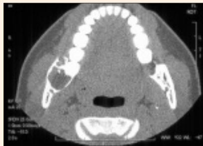
Figure 3c: An expansile lesion with erosive changes, cortical destruction and thinning.