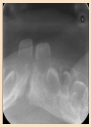
Figure 1: Mandibular anterior occlusal radiograph taken at age 17 days. Neonatal teeth 71 and 81 are present.