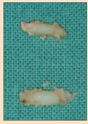
Figure 3: Extracted residual neonatal teeth 71 and 81.

the teeth once the child was out of her incubator and ready to be discharged home.