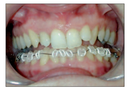
Figure 6: With fixed appliances bonded, the lower incisal edges are contacting the upper lingual brackets. There is no contact between the upper incisal edges and the lower brackets.

Australia,<sup>8,16</sup> Turkey,<sup>17</sup> Israel<sup>10,11,18</sup> and South Africa, although there are a few dedicated practitioners in the United States.