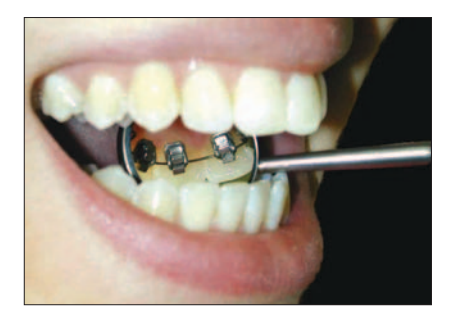
Figure 1: The visual appeal of concealed lingual orthodontic appliances is obvious, especially compared with an earlier fully banded labial orthodontic appliance (Fig. 2). Even modern bonded clear labial brackets hold limited esthetic appeal for many people.