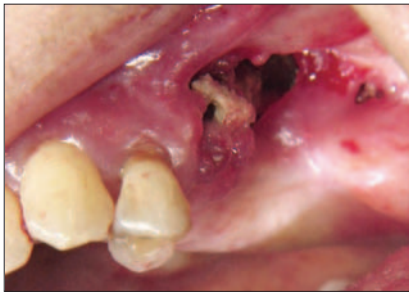
Figure 1: Pre-operative intraoral photograph showing exposed necrotic bone in upper left maxilla.