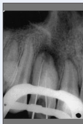
Figure 3: Radiograph with K-files in both canals.