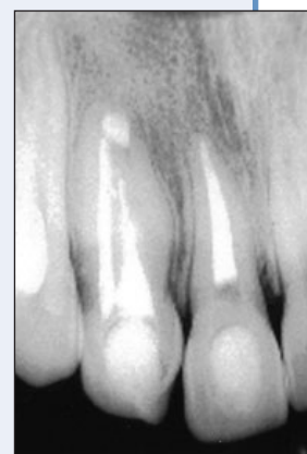
Figure 7: One year after treatment, the radiographic appearance of the periapical area is normal for both the central and lateral incisors.

The purpose of this article is to describe the use of combined endodontic therapy and surgery in the treatment of Type 3 dens invaginatus in a maxillary lateral incisor.