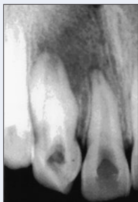
Figure 1: Preoperative radiograph of maxillary lateral incisor showing Type 3 dens invaginatus with periapical radiolucency.