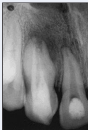
Figure 4: Immediate post-obturation radiograph.