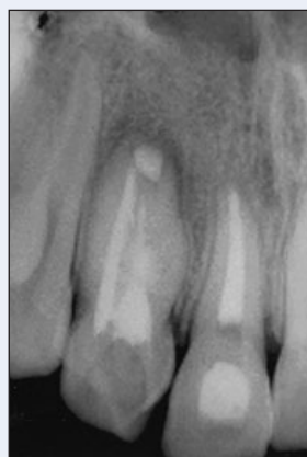
Figure 6: Radiograph taken at 3 months follow-up.