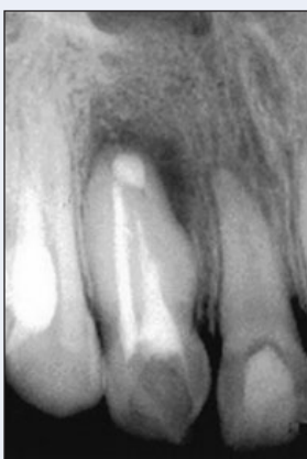
Figure 5: Immediate post-surgery radiograph.