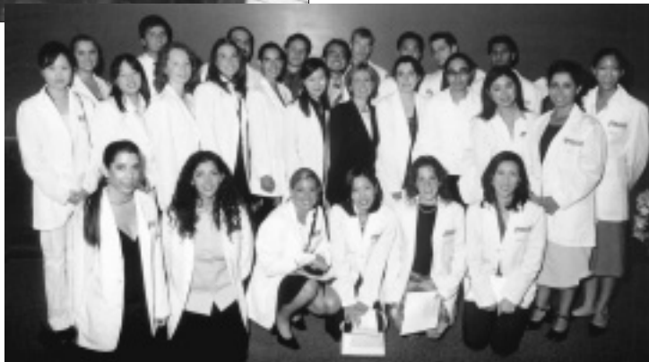
Class of 2005.