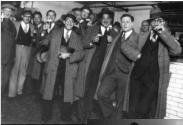
Faculty of dentistry class of 1931 on a tour of Dawe's Brewery.

Through its expanded outreach program, the faculty also gives back much more to the surrounding community.