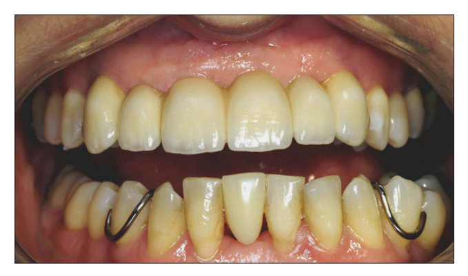
Figure 7: Facial view of final prosthesis.