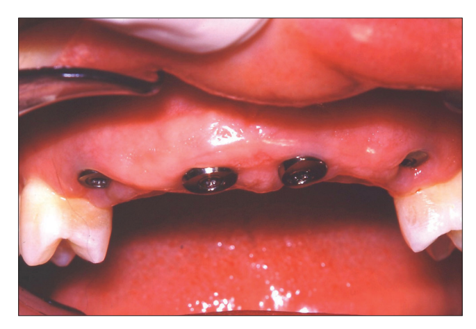
Figure 1: Four ITI implants in a 41-year-old woman, at 3 months after placement, with the healing caps in place