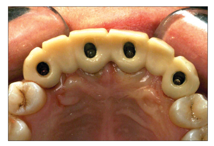
Figure 4: Palatal view of acrylic provisional prosthesis shows the lingual access holes.