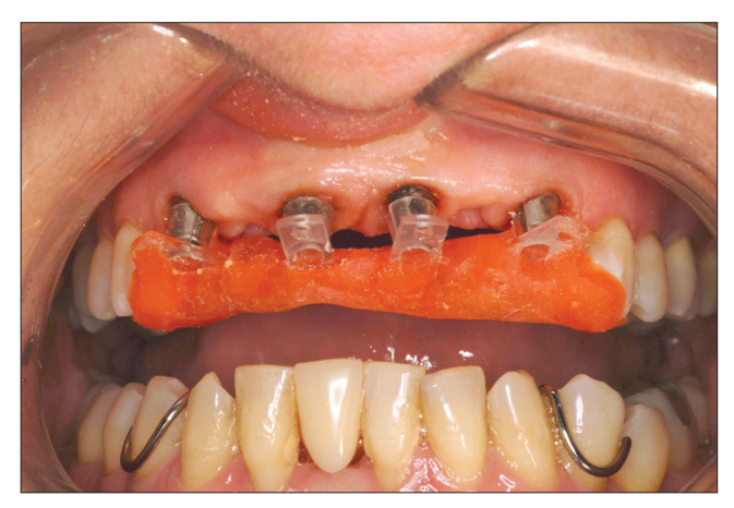
Figure 5: Combination Duralay and transfer aid assembly positioned over the TS abutments.