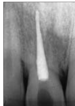
Figure 3: Radiograph of a central incisor affected by replacement root resorption. In the absence of infection, the process is progressive and results in eventual loss of the tooth.