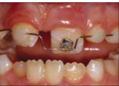
Figure 6c: The appliance employed for active repositioning of intruded tooth 21 in the same patient. Treatment was initiated at the time of initial presentation, and repositioning was accomplished over a period of 6 weeks. Restoration of the crown fracture was completed 7 days after the initiation of treatment.