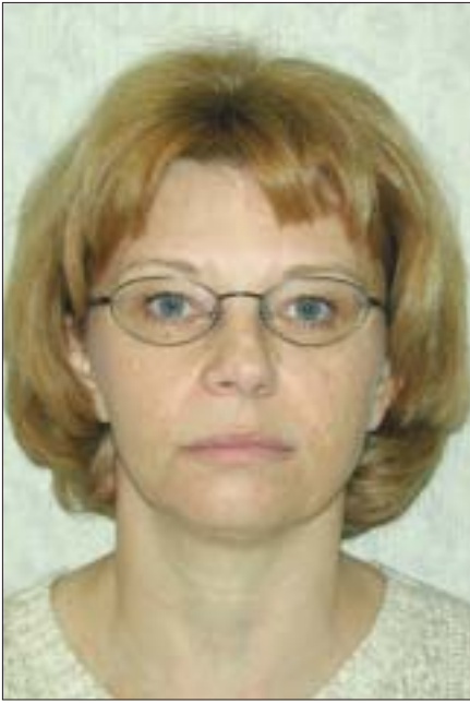
Figure 1a: Preoperative portrait photograph of a patient with a nasolabial cyst under the right alar base of the nose and the maxillary lip. Asymmetry cannot be easily discerned.