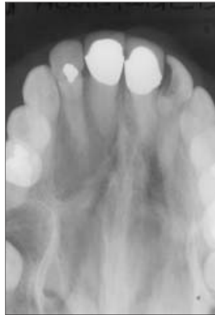
Figure 3: Occlusal radiograph shows a well-defined radiolucent area in the periapical region of the right maxillary incisors. There is slight root resorption of the central incisor.

Postoperative follow-up at 6 months showed good healing without evidence of recurrence. All adjacent teeth remained vital with no further evidence of root resorption.