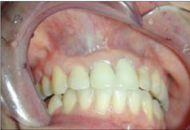
Figure 2: Intraoral view of the nasolabial cyst. The vestibule is distended by the submucosal cystic mass, which has a blue hue.