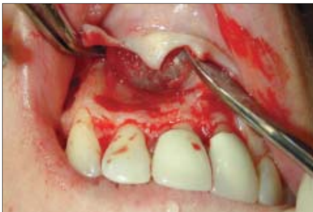
Figure 4: Surgical exposure of the nasolabial cyst reveals the dish-shaped crypt and attachment to the overlying tissue.