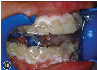
Figure 10: A cellophane wrap is placed gently on the gel. Care should be taken not to push the gel onto the soft tissues.