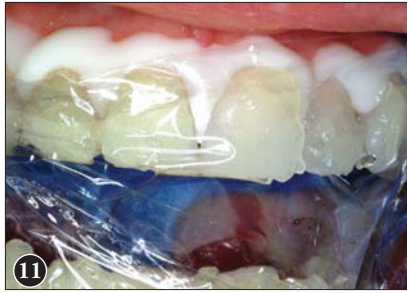
Figure 11: The wrap keeps any oxygen release directed towards the enamel instead of dissipating into the air. More oxygen is thus available to whiten the teeth.