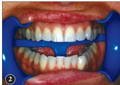
Figure 2: Good retraction is crucial because the powerful peroxide materials can harm soft tissues.