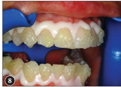
Figure 8: A 35% hydrogen peroxide teeth whitening gel (Rembrandt Lightning Plus, Denmat Corporation, Santa Maria, Calif.) is applied to the freshly etched teeth in 1-mm-thick increments. This gel has a potassium nitrate desensitizer to help eliminate sensitivity.