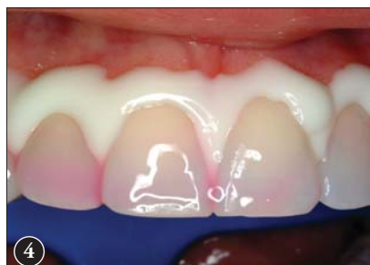
Figure 4: A 37% phosphoric acid gel etchant is applied to the teeth for 5 seconds.