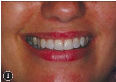
Figure 1: This woman was not happy with the yellow colour of the cervical areas of the teeth. She tried wearing tooth-whitening trays but found that her teeth became very sensitive. She wanted to try one-hour whitening.

of the initial challenges inherent in the procedure. Improvements to the one-hour process include etching the teeth before the application of the peroxide gels, wrapping the teeth to keep the oxygen released by the peroxide close to the enamel, and sealing the whitened teeth with an unfilled resin. Patients report greater satisfaction with this one-hour whitening process, as well as continued whitening for a few days afterwards.