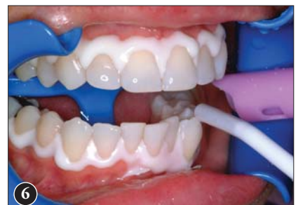
Figure 6: The teeth are lightly dried.