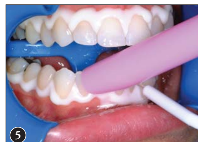
Figure 5: The etchant is thoroughly washed off the teeth.