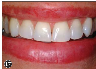
Figure 17: Postwhitening smile with the yellow cervical stains removed.

Improvements to the one-hour tooth-whitening process include use of a cellophane wrap, as well as an etchant and a clear sealant, to deepen the whitening effect of the peroxide gel. Care must be taken to always protect the soft tissues from the strong whitening gels.