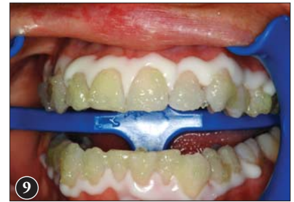
Figure 9: Front view of the whitening gel applied to the teeth.