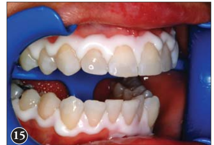
Figure 15: The teeth are milky white after the cellophane wrap and the whitening gel are removed.