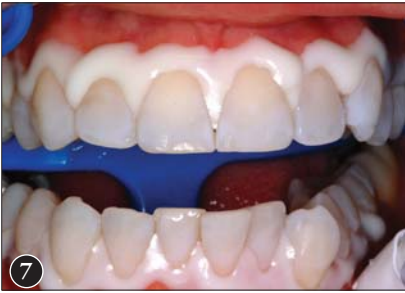
Figure 7: The dried teeth will have a frosted appearance.