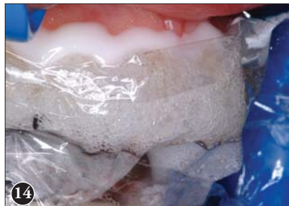
Figure 14: Oxygen release associated with the 35% peroxide formula is significant. The captured oxygen is directed towards the teeth, thanks to the cellophane wrap.