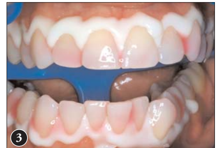
Figure 3: Protecting the soft tissues is key to eliminating sensitivity. A dental dam resin is applied to the dry gingival tissues and cured into place. Most of the sensitivity comes from the peroxide formulations attacking exposed dentin in the cervical regions of the teeth. Great care must therefore be taken to completely cover these areas as well.