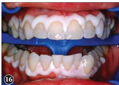
Figure 16: Clear unfilled resin sealant has been painted on the teeth and light-cured to seal the enamel pores that were opened with the etchant. Failure to seal the teeth after the procedure would result in immediate colour absorption once the patient imbibes any kind of chromogenic liquid.