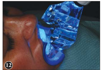
Figure 12: A plasma arc light (Rembrandt Sapphire Light, Denmat Corporation) with a light-diffusing device (Rembrandt Crystal, Denmat Corporation) is placed close to the teeth.