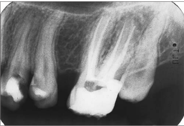
Figure 4b: Postoperative radiograph showing the separation and divergence of the 4-rooted maxillary second molar.

Calcium hydroxide paste (Produits Dentaires S.A., Vevey, Switzerland) was used as an intracanal medicament. A sterile cotton pellet was placed in the pulp chamber, and IRM cement (Dentsply De Trey GmbH, Konstanz, Germany)