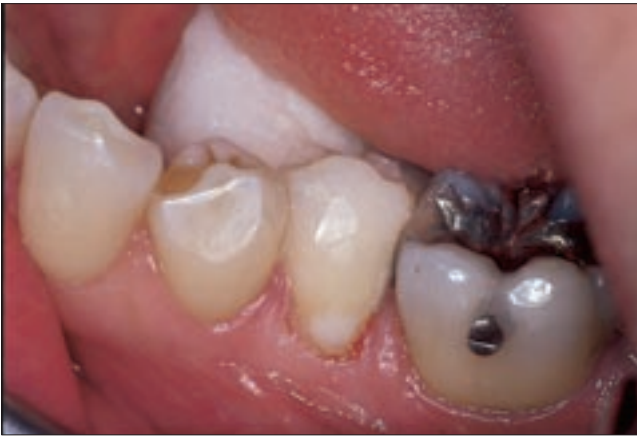
Figure 5: The matrix is removed after 3 minutes, and the peripheral excess is eliminated.