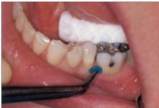
Figure 3: The preparation is conditioned for 15 seconds with Cavity Conditioner (GC America, Alsip, Ill.; 20% polyacrylic acid with 3% aluminum chloride).