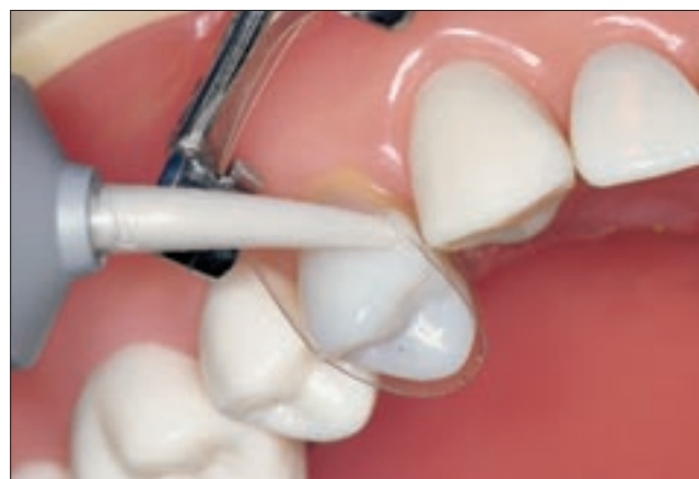
Figure 4: This Typodont (United States Dental Institute, Kingsport, Tenn.) example demonstrates placement of the capsule nozzle to deliver Fuji IX GP Fast glass ionomer (GC America) directly into the cavity after the matrix has been loosely placed. The cavity is slightly overfilled, and the matrix is then secured.

describes and illustrates the preparation of a facial slot Class II cavity and restoration with a highly viscous, rapid-setting, capsulated glass ionomer. The handling improvements associated with newer, higher-density, highly viscous glass ionomer cements (GICs) minimize the porosity and incomplete filling that are associated with less dense cements. A lingually inclined premolar with approximal caries located near the facial aspect is used here to demonstrate the clinical sequence. A post-treatment example of a facial slot Class II restoration with a (more ideal) interproximal relationship is also shown.