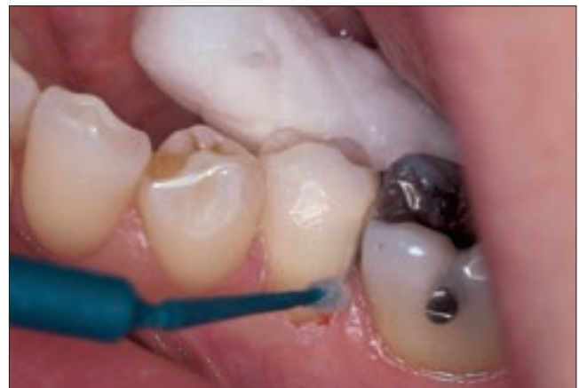
Figure 6: The restoration is protected with either Fuji Coat or Fuji Varnish (GC America).