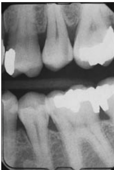
Figure 1: Preoperative radiograph indicates the need for facial slot Class II restoration in tooth 35 after placement of a conventional-approach mesio-occluso-distal amalgam restoration in tooth 36.