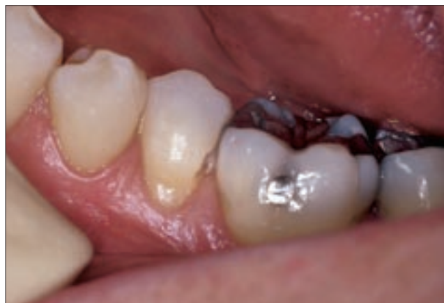
Figure 2: The approximal lesion in tooth 35 has been accessed in the most direct manner possible, and the enamel has been penetrated with a one-quarter round bur.