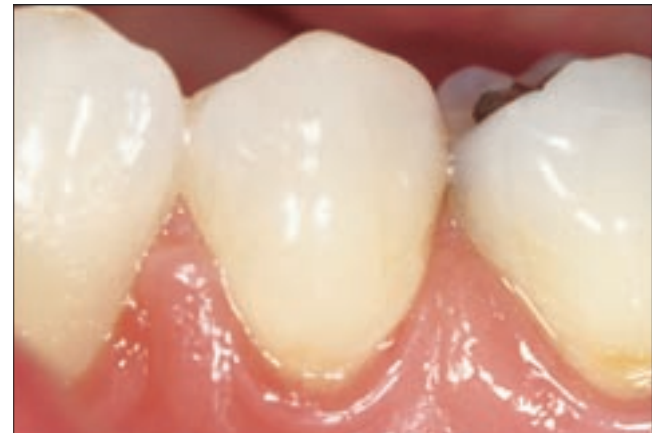
Figure 8: Clinical photograph of a facial slot restoration (distobuccal surface of tooth 34) after 2 1 / 2 years.

supports the possibility of remineralization. 11-12 Non-remineralizable lesions are candidates for facial slot preparations provided that 2 mm of intact enamel (located occlusogingivally) exists beneath the intact marginal ridge. 9 A dental explorer may be used to establish the faciolingual extent of the lesion and to determine how the lesion can be most directly accessed. Frequently, however, the explorer provides no additional information, and in such cases it should be assumed that the lesion is centred beneath the proximal contact.