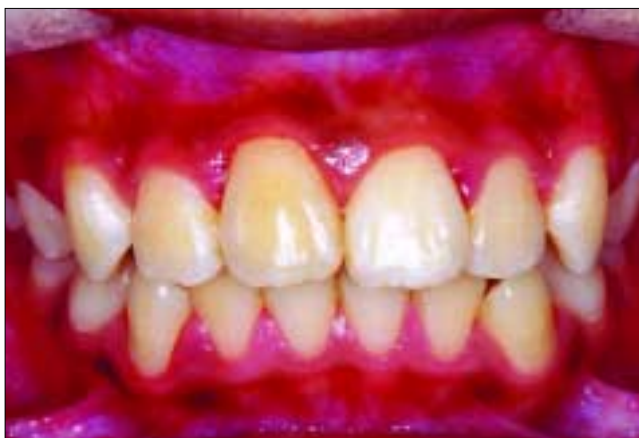
Figure 3: Anterior view of the replanted incisor 2 years after replantation. Mild infraocclusion of tooth 11 is visible.

radiograph was obtained, and no other hard-tissue injury was detected in that region. Examination of the avulsed tooth revealed that the crown was intact and that the root had a nearly closed apex, but the root surface was covered with dried remnants of periodontal tissue. It was estimated that the avulsed tooth had been kept dry for about 18 hours.