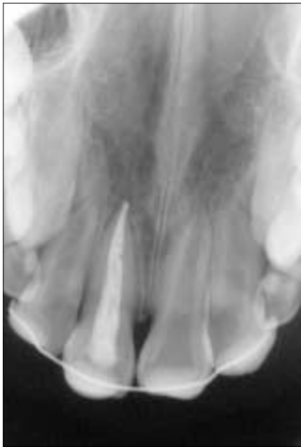
Figure 1: Maxillary occlusal radiograph taken immediately after replantation shows proper repositioning of avulsed tooth 11.