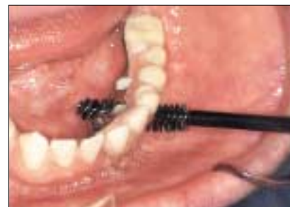
Figure 2c: The casting technique is similar to the one used when designing saddle areas for removable partial dentures. The favourable circumoral activity allows for generous space under the pontics and around the implant abutments for maintenance of hygiene.