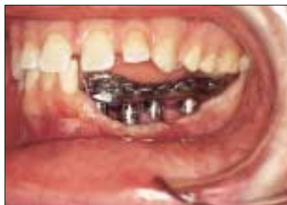
Figure 2b: Interarch space allowed for use of stock prosthetic teeth attached to a silver-palladium framework.