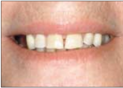
Figure 1a: Patient's smile reveals missing teeth in quadrant 1.