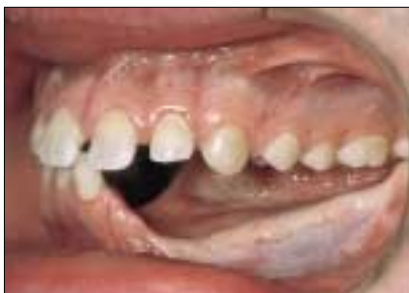
Figure 2a: The left mandibular dentition and its supporting tissues were lost after surgical resection for treatment of a tumour. The grafted site hosts 4 long implants placed in an offset manner to optimize lateral stress resistance.