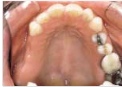
Figure 1b: The partially edentulous span in the right maxilla – occlusal view.