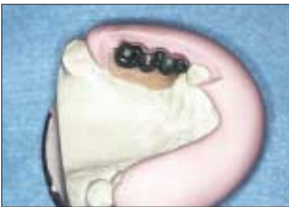
Figure 1c: After a try-in with prosthetic teeth, an index is made and then used to guide the technician's wax-up of a cast frame.