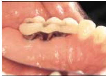
Figure 1d: A metal and ceramic fixed partial denture was selected because of restricted interarch space.

prosthetic experience or desire to avoid conventional removable prostheses. 8 Patients were excluded if they had a brittle medical condition or a condition that precluded minor oral surgery, if their expectations of outcome were unrealistic, if they had a serious psychiatric disorder, if they had a history of substance abuse or if the quantity of the remaining bone was insufficient to accommodate an implant measuring 10 mm long and 3.75 mm in diameter. 8 The problem of insufficient bone occurred infrequently, in patients with advanced resorption of the residual ridge and unfavourable proximity of pneumatized contents of the sinus or inferior alveolar canal. The implant dimensions mentioned were those of implants available at the beginning of the study. Subsequent availability of implants 7 mm long enabled their use as well. Treatment planning principles, which evolved on the basis of experience and published outcomes, led to the dual objectives of a