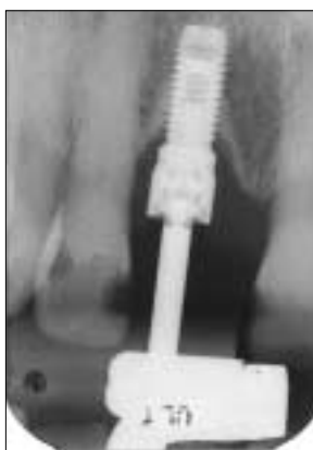
Fig. 2d: Periapical radiograph of the implant at site 11.

lateral and protrusive excursions. Abutment reflection (seen as a grey shadow) under the soft tissue was noted with 7 (23%) of the implants, whereas 8 (27%) had a soft-tissue deficiency. Gingival tissue around 3 (10%) of the implants showed signs of inflammation. None of the implants was associated with fistulae, dehiscence or mobility. Twenty-three implants (77%) had mesial interproximal contact with the adjacent tooth, and 25 (83%) exhibited distal contact. Loose gold screws were found in 4 (13%) of the crowns, but all had gone unnoticed by the patients. No looseabutment screws were observed.