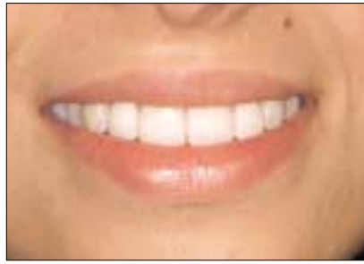
Fig. 4b: Post-operative photograph of the restored single-tooth implant at site 12.