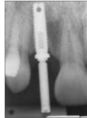
Fig. 4c: Periapical radiograph of the implant at site 12.

Dissatisfaction with the implants did not appear to be correlated with any complications that may have arisen during the loading period, such as loosening of crown or abutment screws or inflammation, although one patient reported dissatisfaction because of abutment reflection under the gingiva. 17 Fistulae have been reported in association with loose abutment screws. 10,13 However, neither fistulae formation nor loose abutment screws were observed in the current study.