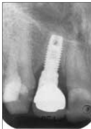
Fig. 3d: Periapical radiograph of the implant at site 22.

overload on implants is that of tactile sensitivity, which is reportedly 3 times less on implants than on teeth. 12 Although 7 implants had occlusal contacts in centric occlusion or excursions, only one patient with such contacts reported the use of an occlusal splint at night. The loading limits of a single implant in different host sites in the jawbones are not known. Long-term success for multiple splinted implants cannot be extrapolated to single implants. Hence the dentist must be particularly prudent in planning single-tooth implants in the context of anticipated differences in magnitude, frequency and duration of forces acting on the replaced single crown. The premise of treatment planning in the IPU has been to “protect” the single implant as much as possible by minimizing or even precluding occlusal contacts on the crown in both centric contact and excursive positions. In fact, the single implant is regarded more as an elegant and ecologically sound space maintainer than as a crown replacement. The comparison of full loading, partial loading and no load-