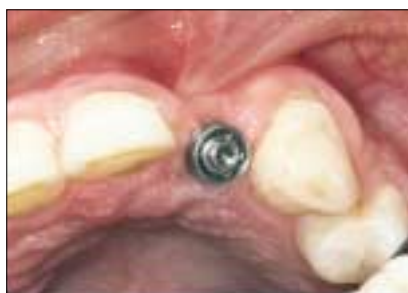
Fig. 3b: Post-operative photograph of the restored single-tooth implant at site 22.