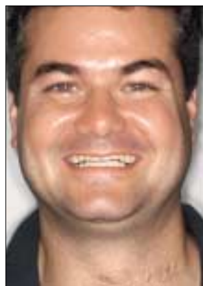
Fig. 3c: Photograph of the full smile showing the completed result of restored implant at site 22.