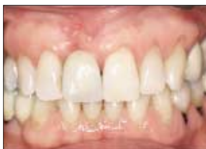
Fig. 2b: Post-operative photograph of the restored single-tooth implant at site 11.