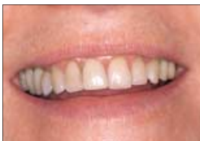
Fig. 2c: Photograph of the full smile of the patient showing the completed result of the restored implant at site 11.